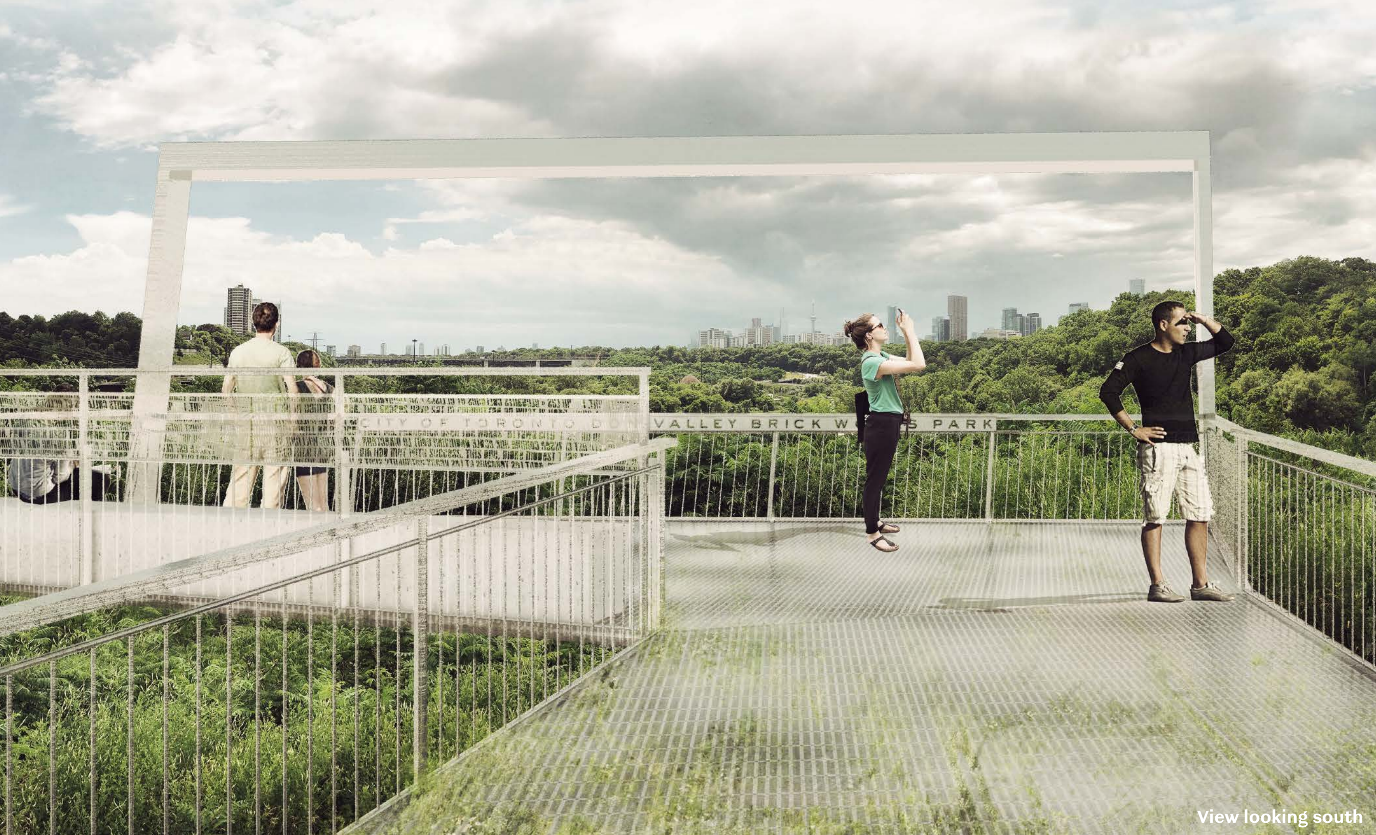
View looking south